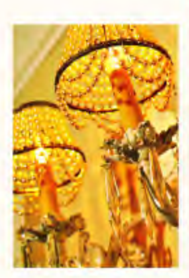
CLOCKWISE FROM TOP LEFT Beaded pearl shades drip. from trystal aconosis; Murns burst from a 1998 silver trophy cup; here / sit on a bubblicious pine. volvet bench with Lourd Ziffer and Linde McFalene, synamic design dus and co-owners of July Port, Los Gates' super-chic home harnightega boundque. opposite, A dmarry pulkadivi serim with feathery. tiebacks division our bednearn inicit a cleeping neak anti a separate sitting area. Mintage luggage stacked as a side table and the gilded mirror gropped up on intique books are lignature July Pom Jooks, Rendere oliver give a line of the tropical touches card in many room.